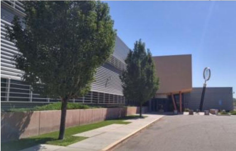
Albuquerque Police Department Metropolitan Forensics Science Center

MorphoTrak, a subsidiary of Safran Identity & Security, together with the Albuquerque Police Department (APD), announced the successful operational deployment of MorphoBIS in the Cloud, the flagship offer of the MorphoCloud platform.